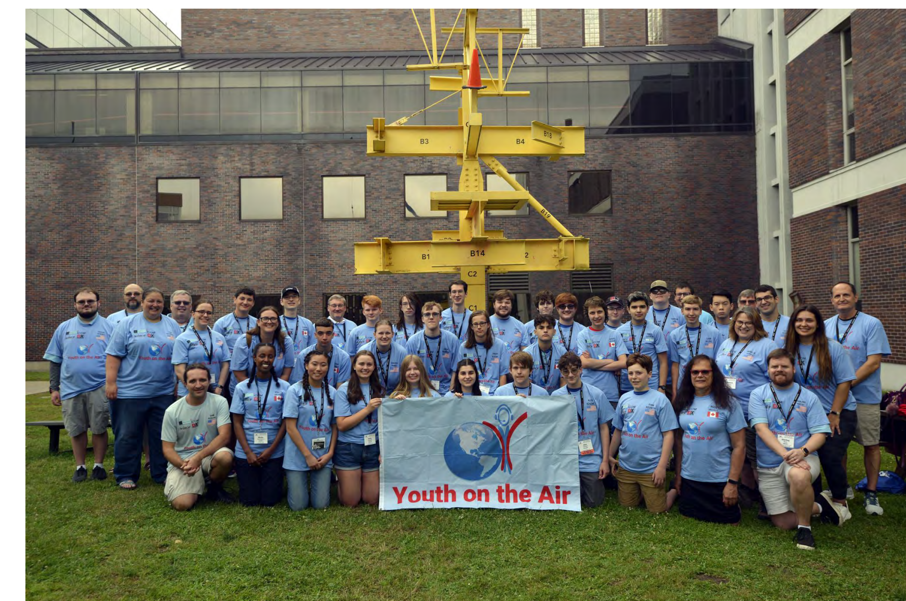
2023 YOTA Americas Official Camp Photo

Applications for the 2024 YOTA Americas camp in Halifax, Nova Scotia are still open until May 31, 2024. Camp is only $100 and includes housing for the week, excluding travel. If you or someone you know would be interested in attending camp, scan the QR codes below to visit YOTA's website!